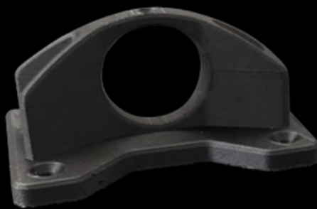
PIPE WELDING FIXTURE