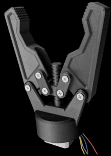
ROBOTIC GRIPPER ASSEMBLY